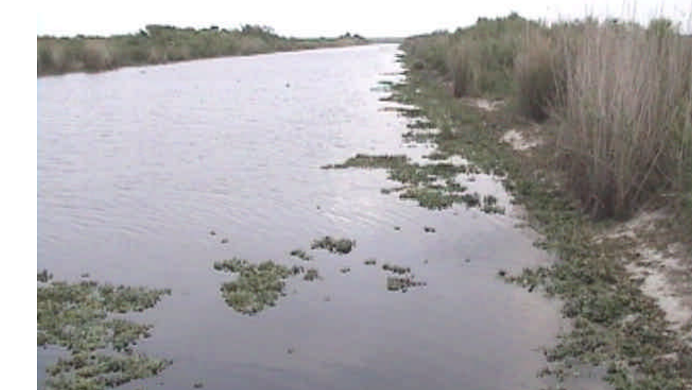
Perimeter Canal & Levee