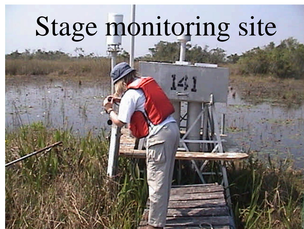
Stage monitoring site