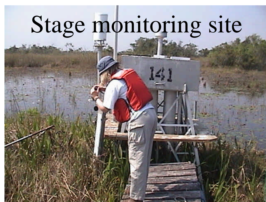
Stage monitoring site